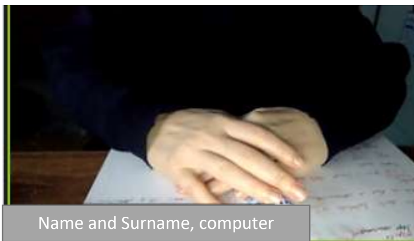
Figure 1: Correct position of computer camera

Before the exam, the student registers in ZOOM via a computer with a camera AND a mobile phone. During the examination, the computer camera must be focused on the paper on which you are writing down the answers, so that the hands are visible throughout the entire process, even when you have already answered the questions (see Figure 1). The camera on the mobile phone must be aimed at the upper body and the work surface, as shown in Figure 2. During the examination, the camera must be turned on on both devices. The microphone must be unmuted only on the computer during the entire process.