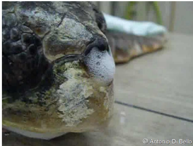
Figure 14: Foam spilling from the nostrils due to a pulmonary edema, caused by a prolonged apnea in the trawler net.