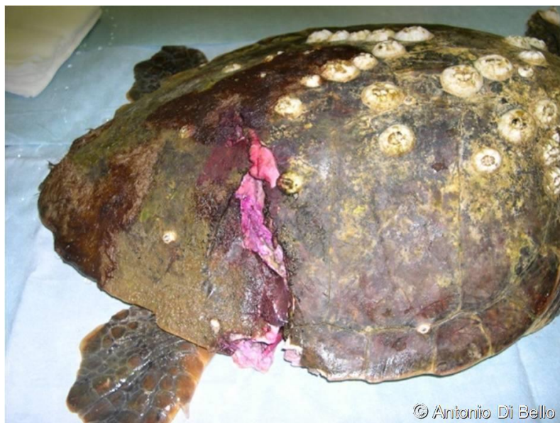
Figure 9: Wide and deep injury of the carapace caused by the impact with a boat.