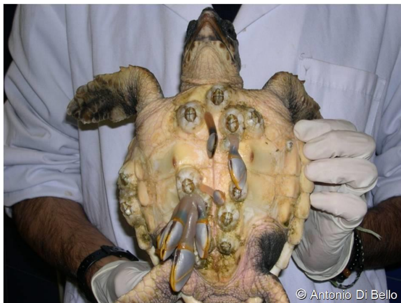
Figure 8: Turtle with many barnacles and goose barnacles attached to the plastron.