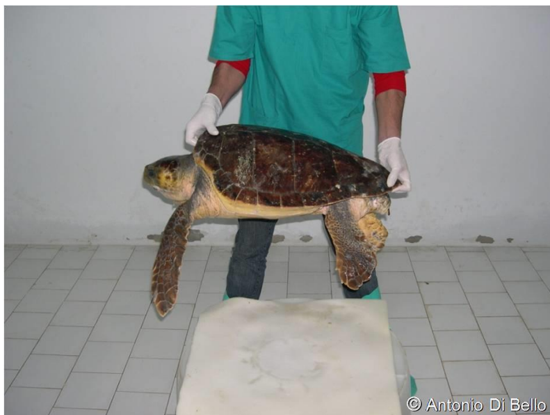
Figure 3: The image shows how a single person can take the turtle properly.

For turtle and people safety, it's important to follow some correct procedures in order to raise, pull out of the tank and move a turtle. Depending the size, the animal is carried by one or two people. A single person can keep firmly the animal with one hand below the rear edge of the carapace, in correspondence of the caudal shield, and the other hand firmly to the cranial margin of the carapace, in correspondence with the nuchal shield (figure 3).