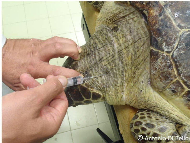
Figure 19: Puncture of lateral occipital sinus.

The jugular vein sample is obtained containing the animal with the head in extension and inserting the needle of one of the two sides of the neck, in a cranio-caudal direction and with an angle of approximately 30 degrees to the skin. The needle is inserted in the depression of the neck just below the transverse cervical muscle (figure 20).