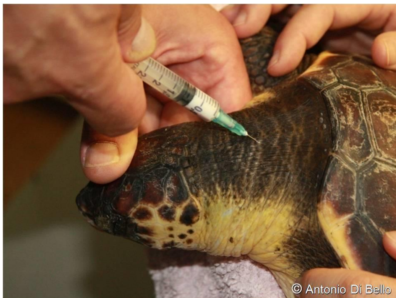
Figure 18: Puncture of supravertebral cervical venous sinus.

require a minimum of experience and manual skills. The use of the supravertebral cervical venous sinus is realized containing the animal with the neck extended and slightly down. The needle connected to the syringe is introduced into the dorsal surface of the neck, in the paramedian position between cervical spine and cervical biventer muscle. The needle is inserted with an angle of about 45-60 degrees in the skin, either on one of the two sides, in an area between the neck and the cranial edge of the carapace (figure 18).