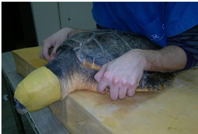
Figure 17: Positioning of the operator to properly restrain the turtle (lateral view).