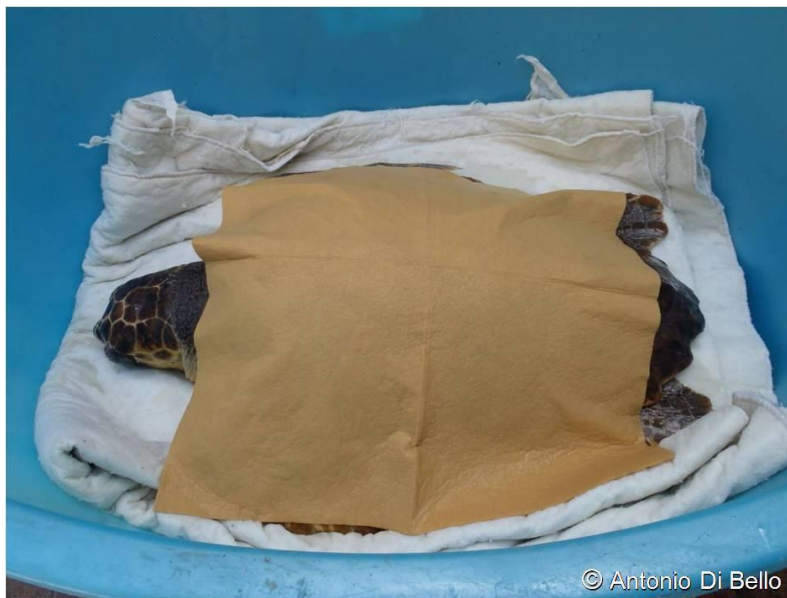
Figure 1: The turtle is placed in a plastic container on a towel folded in several layers. The body is covered with a wet cloth.

During the transfer to the rescue center it's important to keep the head, neck, carapace and flippers moist or wet. Covering the body with a cloth soaked in sea water may be the easiest way to do so (figure 1).