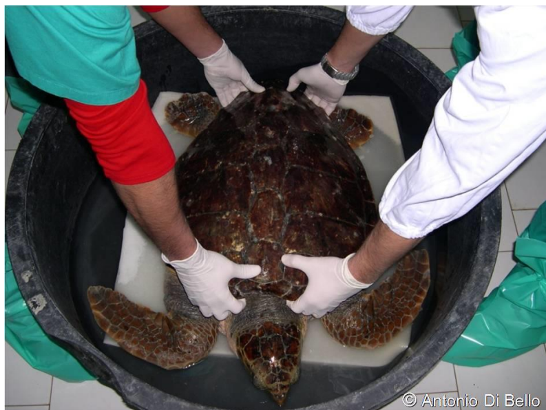
Figure 5: The proper way to take the turtle in two persons.