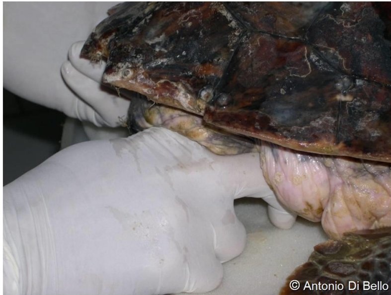
Figure 21: Faecal sampling directly from the rectum.