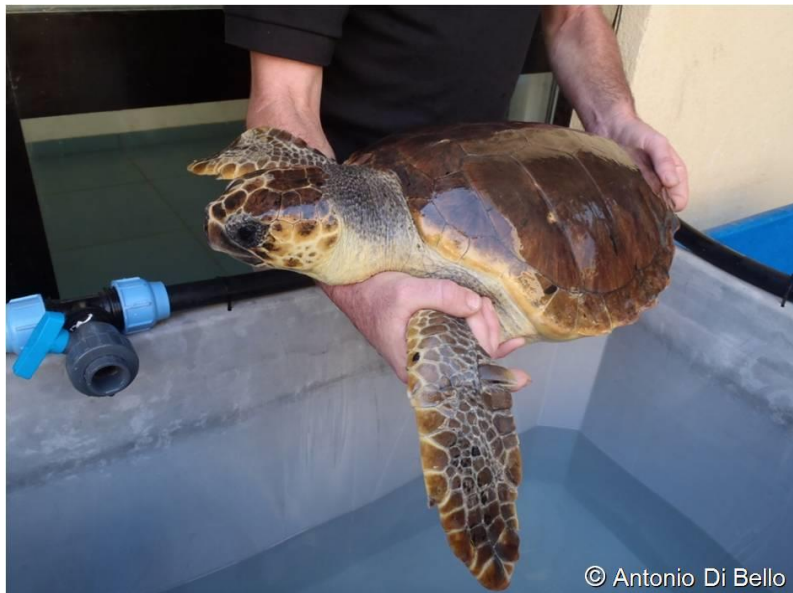
Figure 4: Another correct way to take a turtle.

If the animal is large and heavy, two operators can move the animal from both sides, with their hands positioned cranially and caudally of the carapace (figure 5).