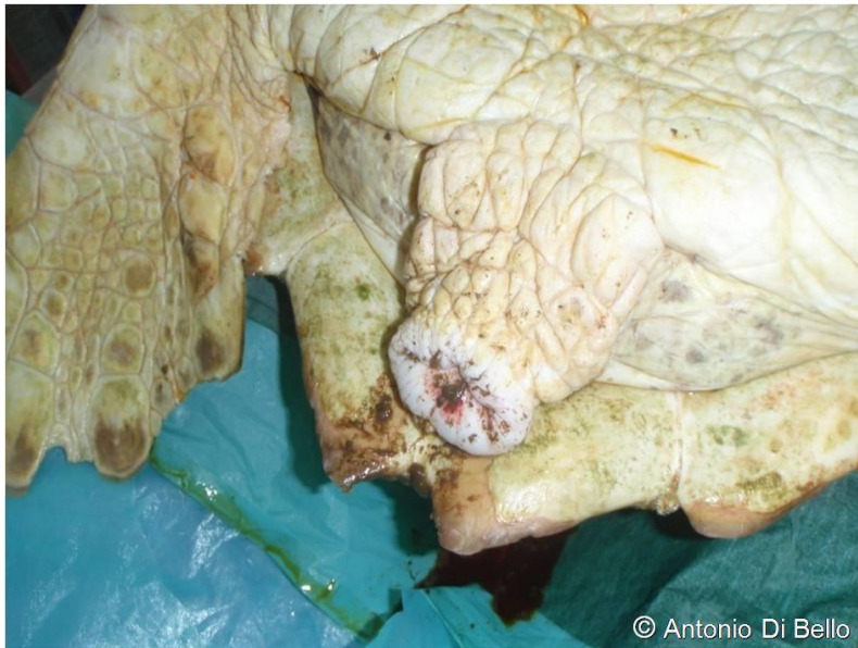
Figure 13: Slight prolapse of the cloaca and edema of the surrounding soft tissues caused by a longline crossing the intestine.

The external inspection of cloacal opening evidence if there is a line or a prolapse or edema of the surrounding soft tissues (figure 13).