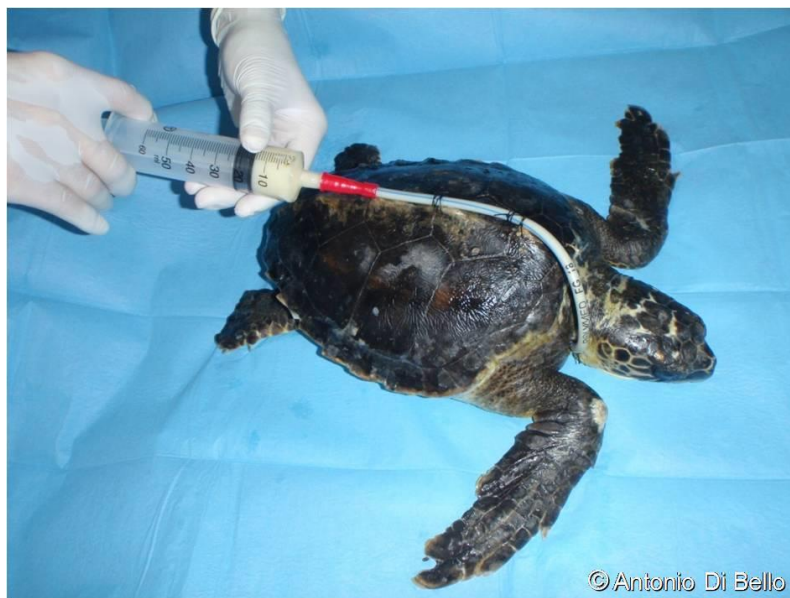
Figure 22: Execution of forced tube feeding in a small turtle.