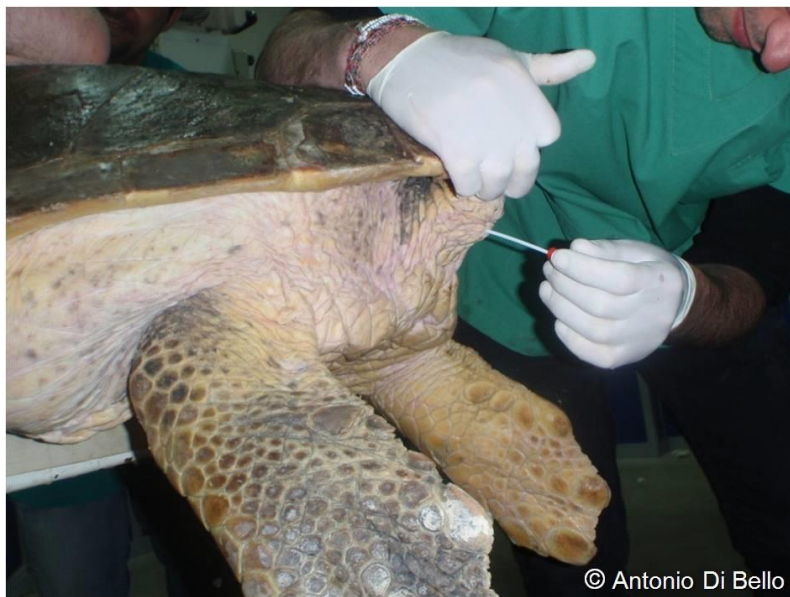
Figure 15: Evaluation of cloacal reflex with a wet cotton swab.

The assessment of the sensorium status is carried out through reflexe stimulations and physiological reactions. Reflection tests are retraction of neck and fins, opening of the mouth, blink reflex, as cloacal and tail ones. Normally after a slight traction of the head or of the end of a fin, the animal instinctively retracts the part. Another reaction is stimulated by lifting with caution the top of ranfotec: the animal often reacts instinctively arching high the neck and opening the mouth, this reaction is also very useful to inspect the oral cavity. Blink reflex is stimulated by tapping lightly with a soft object (eg. a wet cotton swab) the lateral or medial margin of the eyelids: to this stimulus the animal normally reacts with the quick closure of its eyelids. In normal conditions, a gentle introduction of the tip of a finger or a wet cotton swab into the cloaca or moving laterally its tail, the animal reacts by contracting the cloacal sphincter and ventral bending forward the tail (figure 15).