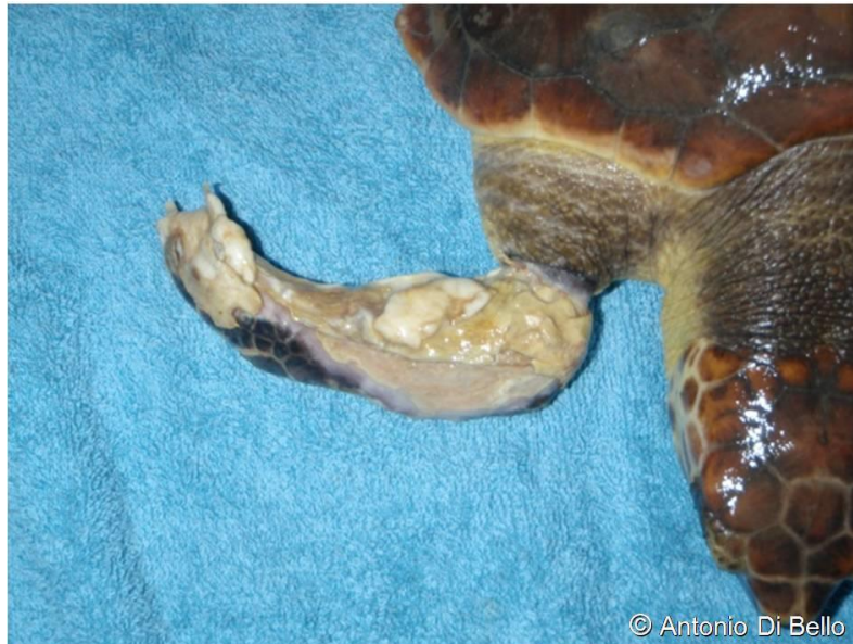
Figure 10: Tissue necrosis of the flipper caused by fishing lines constriction.

Very serious neck and limbs injuries can be caused by lines, ropes, plastic bags or other foreign waste floating in the sea (figure 10). Skin lesions, localized or diffuse, can be caused by primary and secondary bacteria and fungi growth, in this case it is important to carry pads and skin scrapings for identification of causative agent.