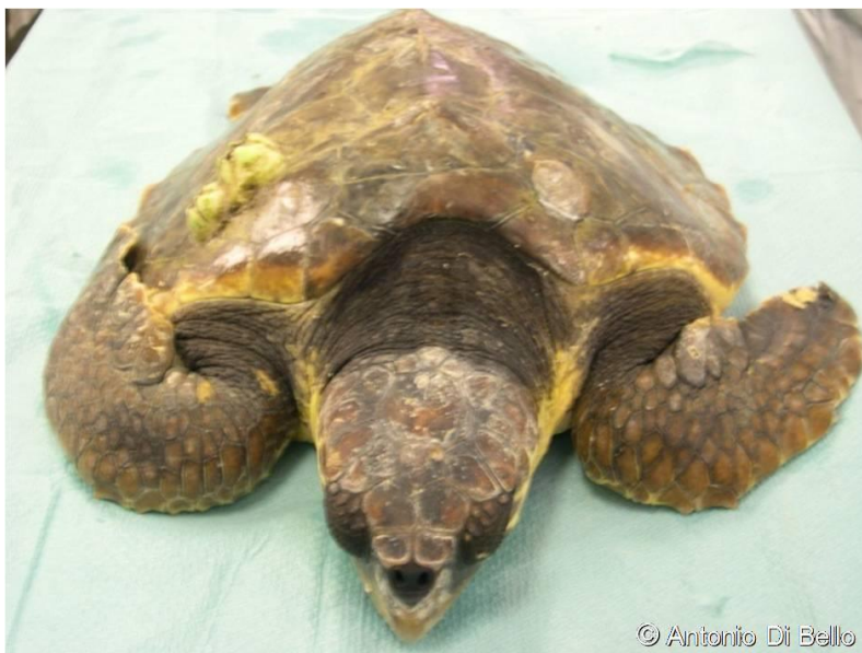
Figure 7: Turtle in a poor state of nutrition.