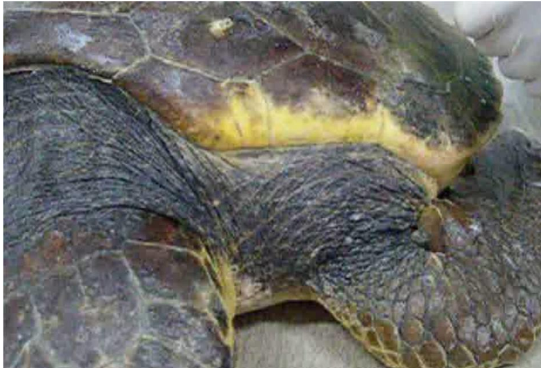
Figure 6: Turtle in a good nutrition status: it is evident abundant fatty tissue under the skin of the neck and axillary region.

elastic consistency due to the presence of adipose tissue (figure 6). In animals undernourished, axillary and inguinal regions appear sunken, the skin around the neck is not very elastic and the below muscles become evident (figure 7).