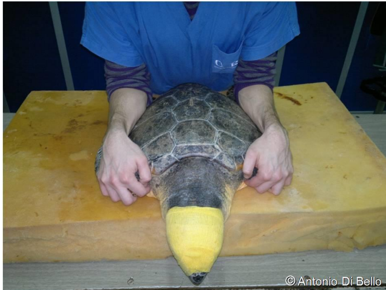
Figure 16: Positioning of the operator to properly restrain the turtle (frontal view).