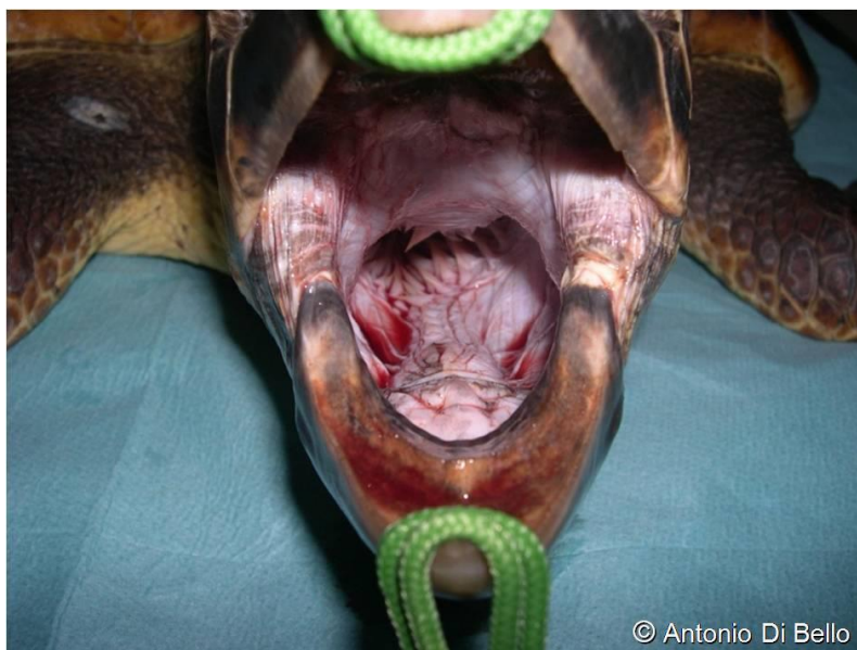
Figure 12: The deep inspection of the oral cavity reveals a bleeding in the esophagus.