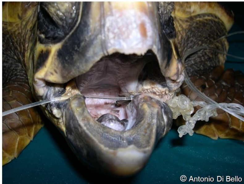
Figure 11: Long line coming out of mouth and has caused serious injury and necrosis by compressing the lower jaw.

other injuries; their nature should always be determined through the execution of sterile swabs and laboratory tests (figure 12).