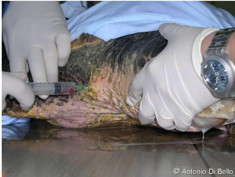
Figure 20: Puncture of jugular vein.