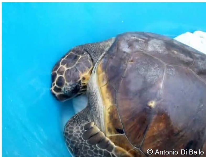
Figure 2: The turtle has taken an abnormal and dangerous position of the head that makes breathing difficult.

During transport, it is appropriate to reduce stress for the animal: keep it in shadow, avoid noise, cover and protect its eyes, do not limit its ability to breathe properly, and avoid contact with other animals. In addition, it is requested to avoid animal movements into the tank, maintaining it in a normal ventral position without compressing it or assuming limbs and head abnormal positions (figure 2).